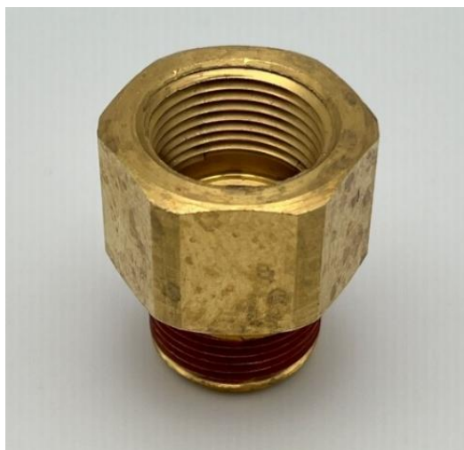
Figure 3 Non-affected F8426 (not stamped with "CB8426")