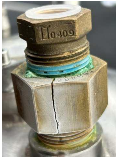
Figure 2 Cracked CB8426, PRV Adaptor