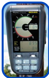
The Flytec 3040 is standard on all models

Also available is the newer Flytec 6040. The 6040 has all the features of the 3040, plus a built-in GPS to give you realtime speed and direction, a record of wind speed and direction in each altitude layer, and an automatically recorded flight log.