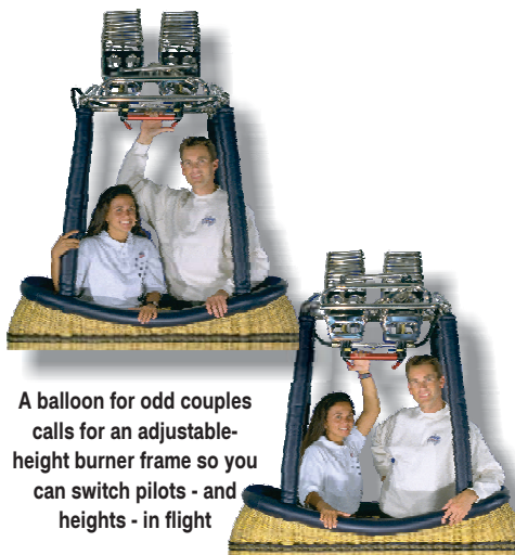
A balloon for odd couples calls for an adjustable-height burner frame so you can switch pilots - and heights - in flight

Ergonomics - integrating the machine with the pilot, making the machine obey your every command. It means putting the controls where they are easily accessed. It means identifying controls - by color or feel - so you can instantly know what response to expect. It means protecting controls so they are not accidentally turned on or off, or damaged during ground handling and transport. There's Cameron's wide-angle gimbal which lets you easily inflate your balloon - with no one holding the mouth. That means fewer crew needed and fewer problems with melt damage, even when the envelope is rolling around in a breezy inflation. There's more: Cameron's pneumatic adjustable-height burner frames are built for comfort and safety: a seven-inch adjustable range means whatever your height, you can reach all the controls without strain.