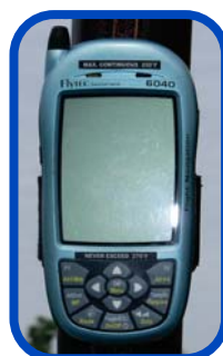
Also available is the Flytec 6040 with a built in GPS

A padded bolster-mount is available for either Flytec instrument for those who prefer the more traditional instrument location.