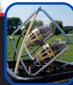
The articulated joint at each corner of the burner frame not only absorbs shock and torque on landing, it makes assembly of the burner easier, too