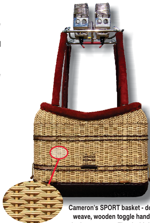
Cameron's SPORT basket - double weave, wooden toggle handles, single entry step. Fitted with heavy latigo leather scuff edge