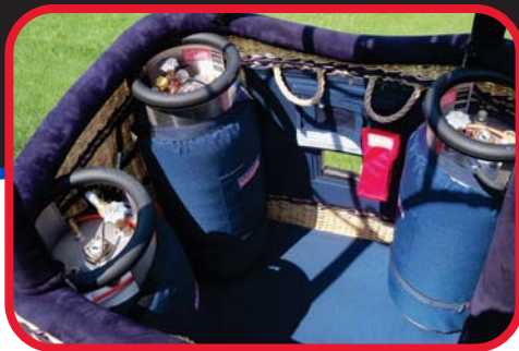
Cameron's cushion floor & walls add to impact absorption and provide some very neat places to store maps, strikers, and pilot gear.