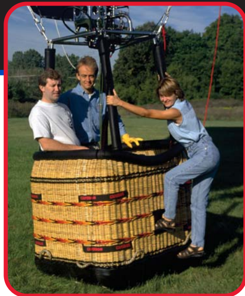
The convenient step-holes make every basket simple to climb in and out of, yet the tall sidewalls give your passengers an extra feeling of security