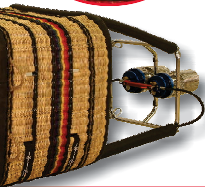
42 x 58 Aristocrat Flat-Top, High-Spec basket, capable of carrying 20 gallon fuel tanks, has staggered step holes to make it easy to enter and exit (shown with optional Safari Skids)