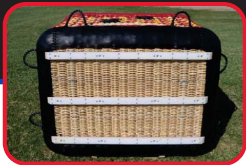
Cameron's standard woven floor - provides maximum shock absorbcency (shown with optional poly skid guards)