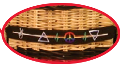
Optional personalized tank belts give the basket a finished appearance that adds value to the whole ownership experience

Our FlexiRigid™ system is the most imitated feature of Cameron baskets. We believe in the shock absorbcency of our flexi poles (and we have a lifetime replacement warranty on them) because they can torque - so your passengers don't have to. And our FlexiRigid™ system works even better because it is mated to an articulated joint on the burner frame. Cameron's articulated connection is like a car's universal joint - it allows independent movement of the pole and burner frame, giving ultra shock absorbing benefits to you and your passengers. This truly completes the principle of protective comfort built into every Cameron basket - and now even breezy landings become exhilarating instead of frightening.